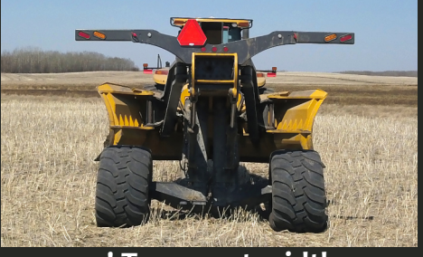
Right Tilt 12' Transport width