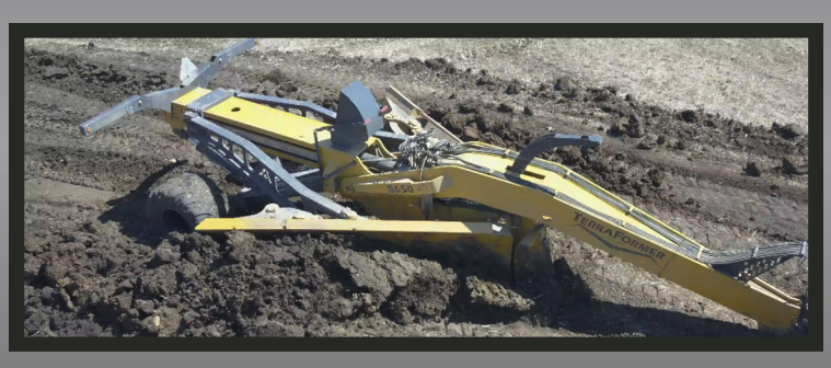
Continuous earth moving